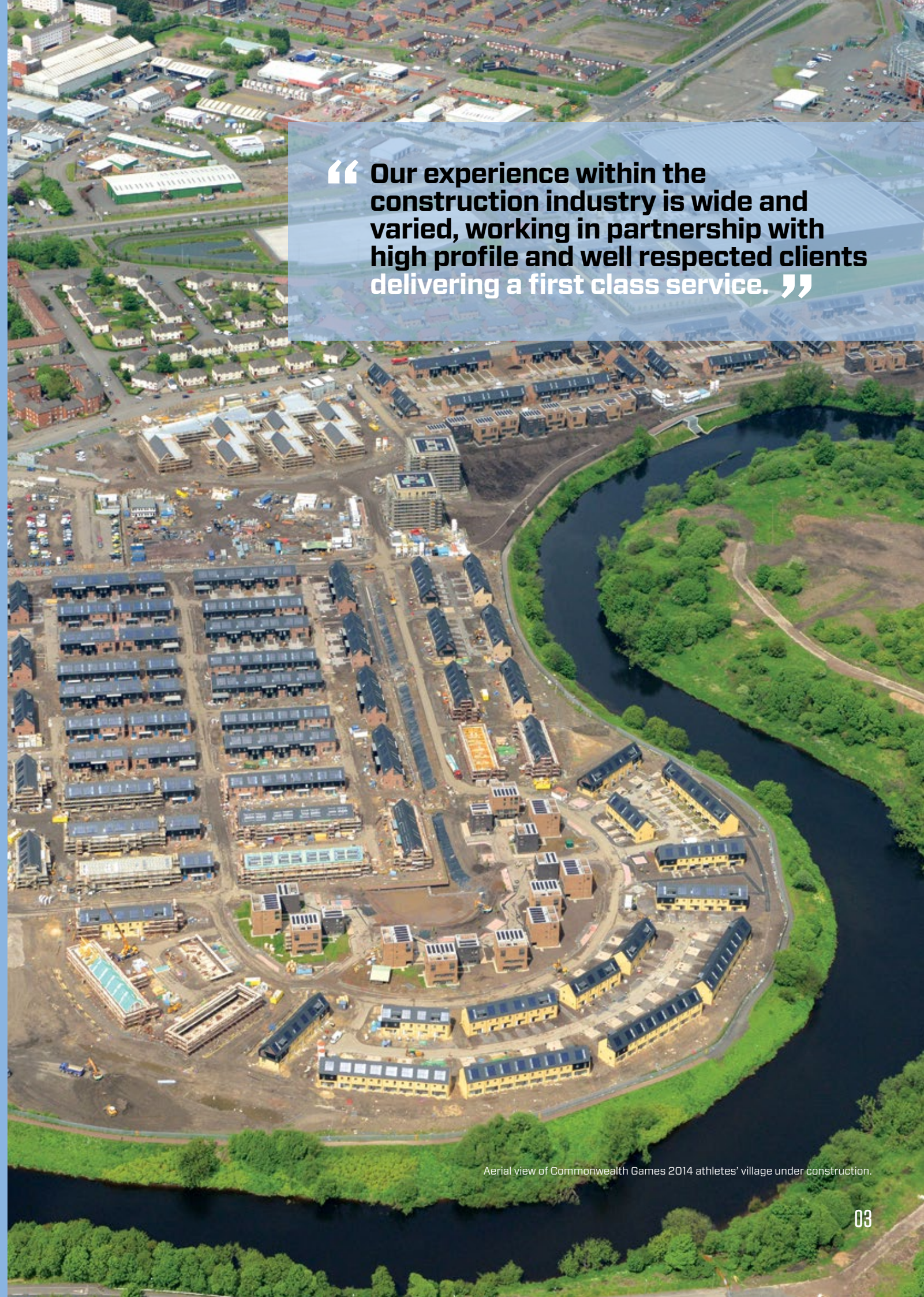
Aerial view of Commonwealth Games 2014 athletes' village under construction.

“ Our experience within the construction industry is wide and varied, working in partnership with high profile and well respected clients delivering a first class service. ”