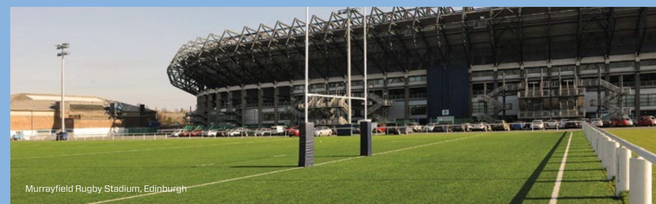
Murrayfield Rugby Stadium, Edinburgh

We also build leisure facilities and associated sports infrastructure, all designed, constructed and installed by our own highly skilled staff.