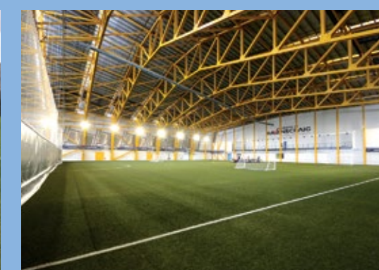
Ravenscraig Sports Centre