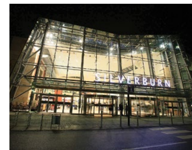
Silverburn Shopping Centre, Glasgow

Our C.V. is second to none and includes some of Scotland’s finest buildings including:-