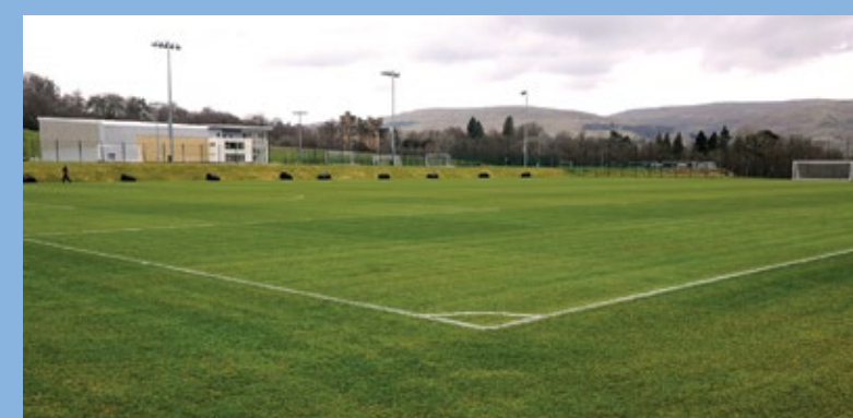
Celtic Training Ground