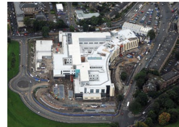
New Victoria Infirmary

Our scope of works embrace every aspect of the construction cycle from the initial site survey to liaising with the Project Engineer on land maximisation; re-profiling the earthworks to required design levels; drainage and roads; foundations and buildings; ground floor slab, surfacing and finally, any finishing touches required around the project. And, with a wealth of resources to call on, including our in-house training, health and safety and surveying departments, our management and contract team bring exceptional experience in all aspects of civil engineering to all contracts. This one-stop-shop approach is underpinned by our “get it right first time” attitude.