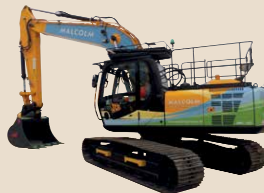
JCB JS220 22T EXCAVATOR