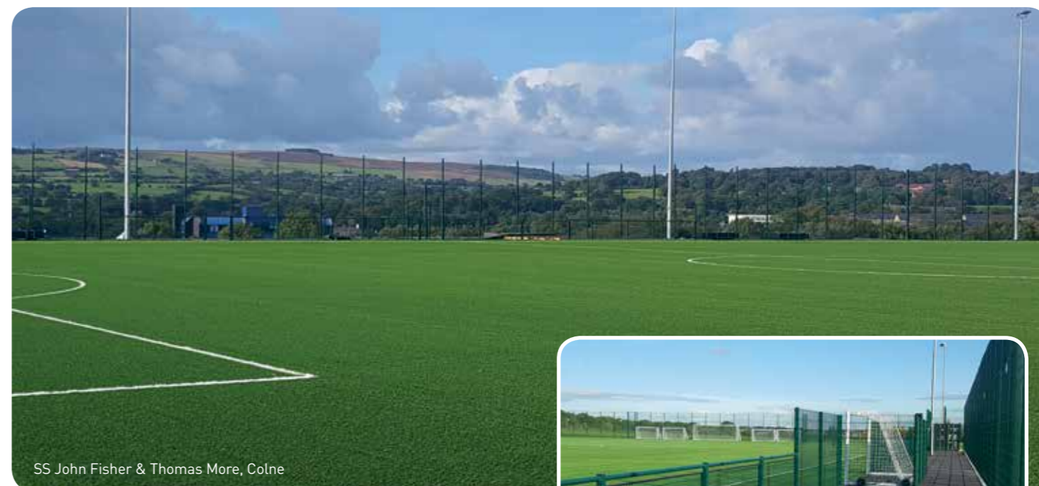
SS John Fisher & Thomas More, Colne