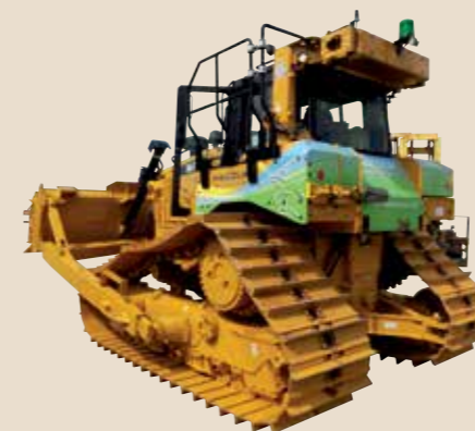
CAT D6T DOZER