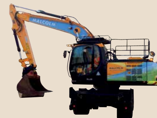
JCB JS200W RUBBERDUCK