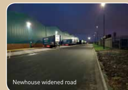
Newhouse widened road

The remaining part of the old building has been "over-clad" with new sheeting and new drainage fitted all around. Part of the building has been taken down and moved approximately 20 ft to allow the existing roadway to be widened to allow easier access to the trucks.