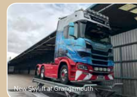
New Skylift at Grangemouth