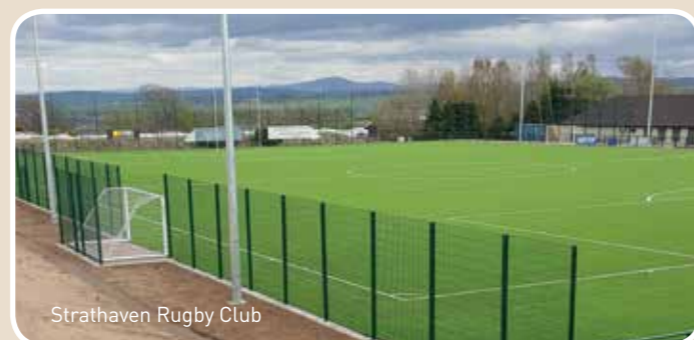
Strathaven Rugby Club