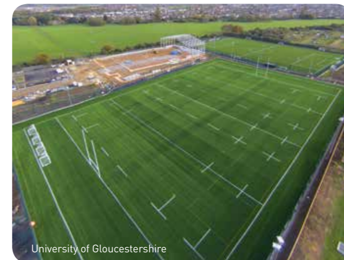
University of Gloucestershire