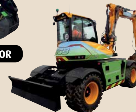
JCB HYDRADIG 10T RUBBERDUCK

For more information on our Plant Hire division, please call 0141 435 5252 or email plant@whm.co.uk .