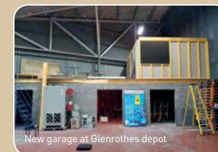
New garage at Glenrothes depot