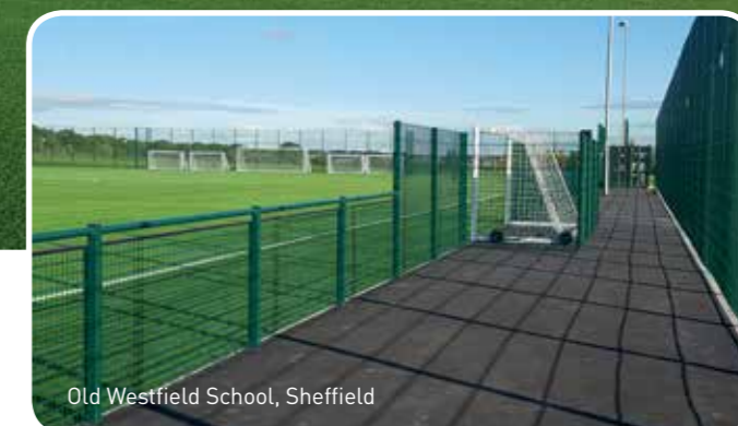
Old Westfield School, Sheffield

To highlight just a few, we have installed two full size football pitches at Old Westfield School in Sheffield, as well as installing a new rugby pitch at Olympic Legacy Park in Sheffield – which is on the site of the former Don Valley Stadium. The University of Gloucestershire has also had a full size football pitch and a full size rugby pitch installed on their grounds.