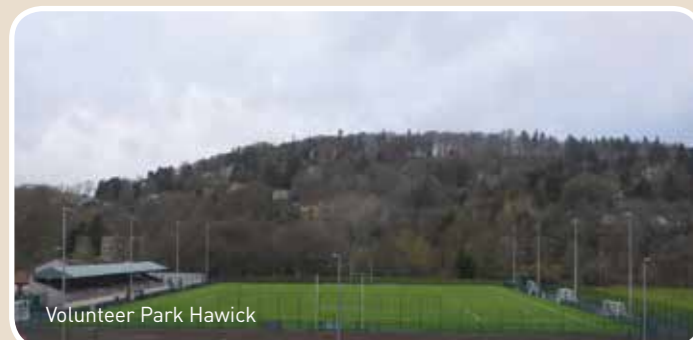
Volunteer Park Hawick